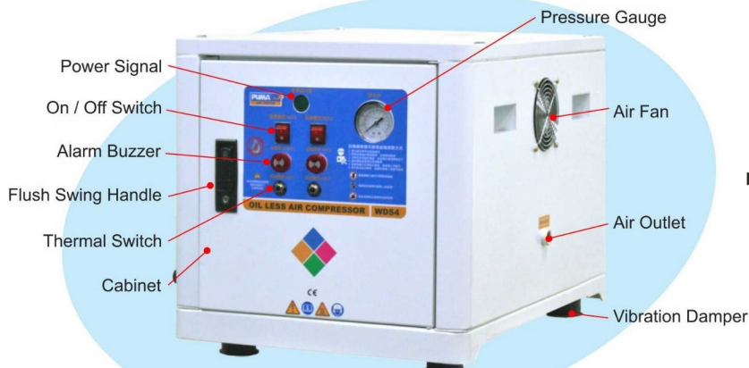
WDS4 / WDS2